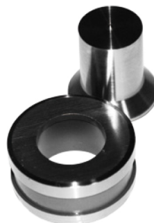
Steel Plate Punching Dies : 10.5 、 13.5 、 17.5 、 20.5

※ Customize punching die set also available, sold separately.