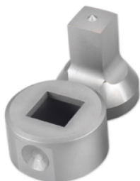
Square Punching Dies : 5/16" 、 3/8" 、 7/16" 、 1/2"