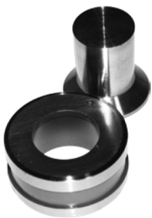
Copper Plate Punching Dies : 10.5 、 13.5 、 17.5 、 20.5