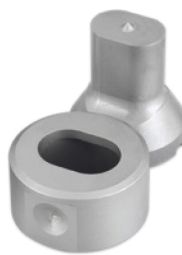
Oval Punching Dies : 5/16" 、 3/8" 、 7/16" 、 1/2"

※ Customize punching die set also available, sold separately.