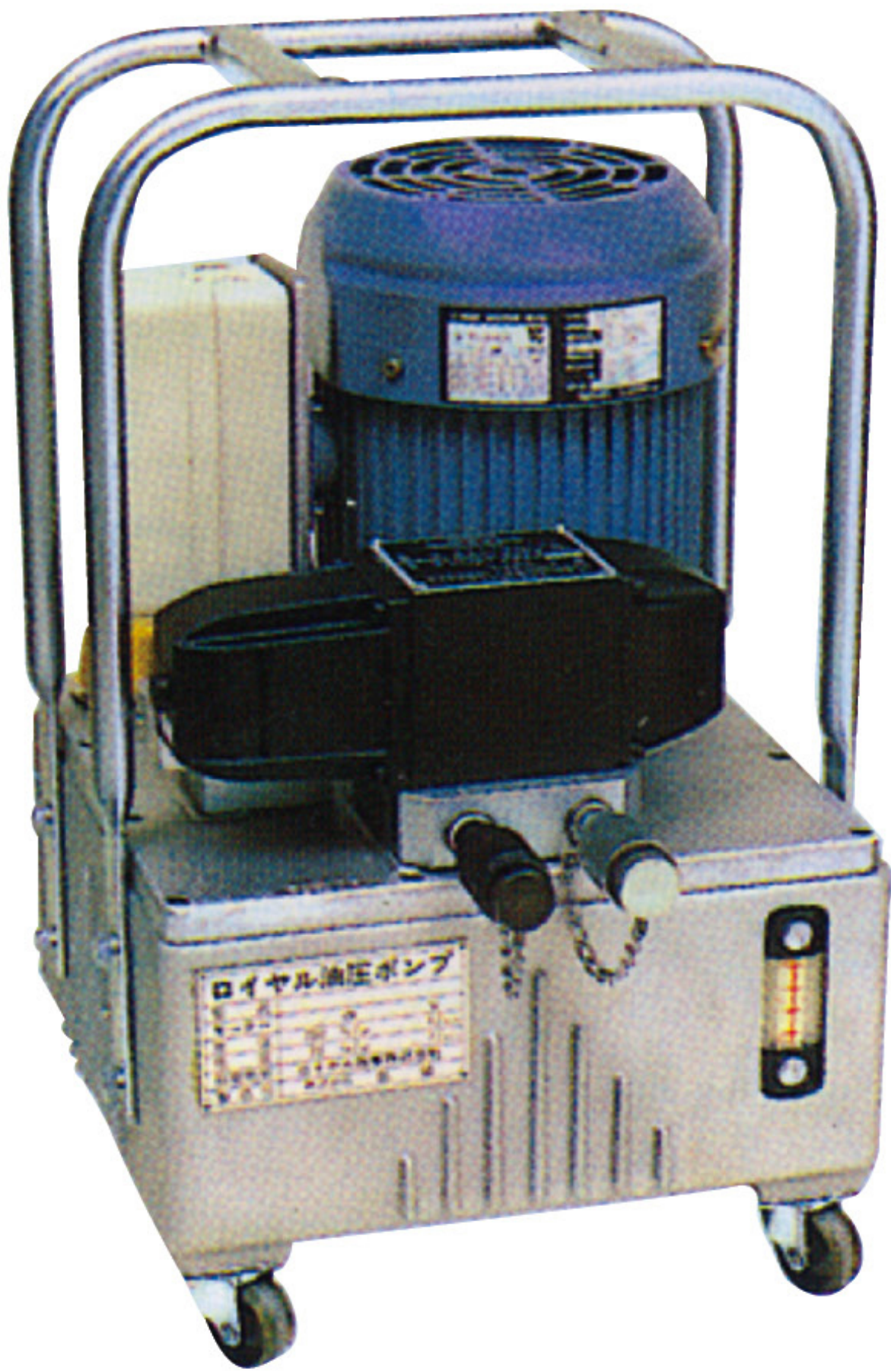
D-2SW-4 Double return way of power over high pressure