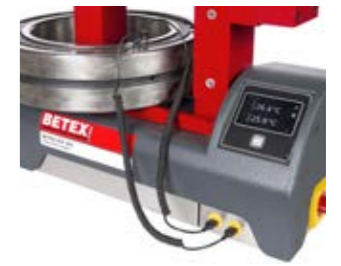
Dual temperature sensing (monitoring \Delta T )