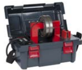
Induction heater Betex portable BETEX BLF 200