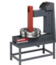
SUPER cap. 600kg