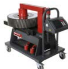
40 RMD cap. 600kg