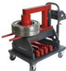
40 RSD cap. 350kg