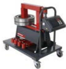
38 ZFD cap. 300kg

BETEX® is a registered trademark of Bega Special Tools