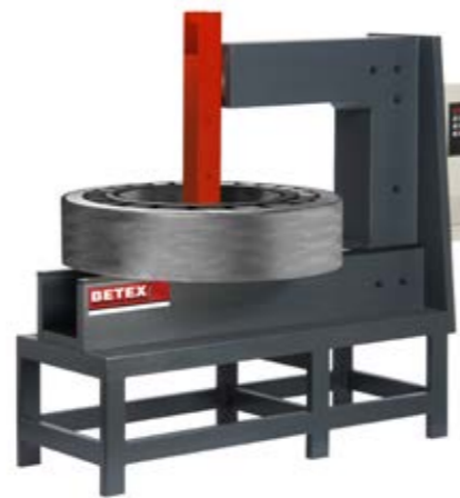
GIANT cap. 3500kg